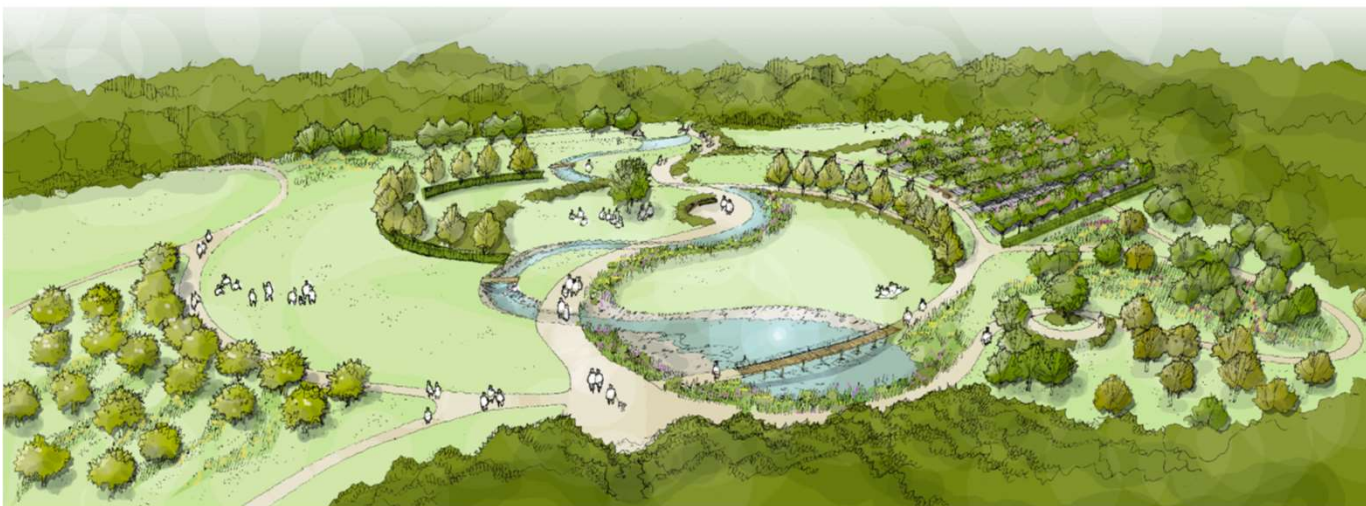
An artists impression of how the cemetery could look