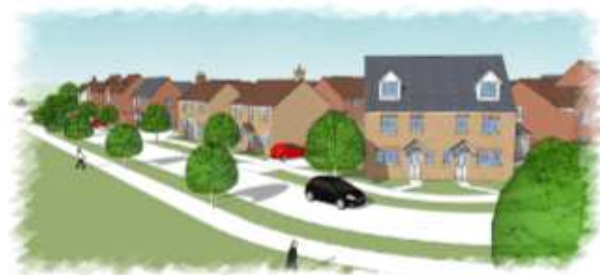
Weights Lane, Redditch